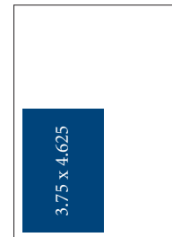
1/4 page 3 3/4" x 4 5/8"