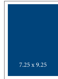
full page 7 1/4" x 9 1/4"